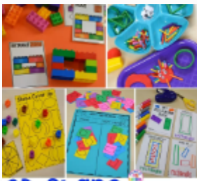
2D SHAPE activities